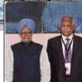
Hon'ble Prime Minister of India, Dr. Manmohan Singh at the launch of the Apollo Reach Hospitals, Karaikudi